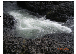
Picture of the Molalla River in the Corridor.