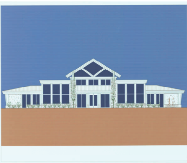
3-D rendering of development

Urban Renewal District. This Planning Commission is not only working hard to establish master plans and visions to accomplish in the future through written documents they are more excited about implementing the plans.